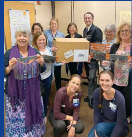
Command Center staff receiving donation of face shields from Ford Motor Company (photo was taken prior to mask mandate)