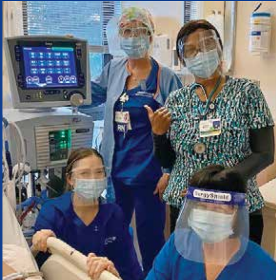
Nurses with new ventilator for COVID-19 patients