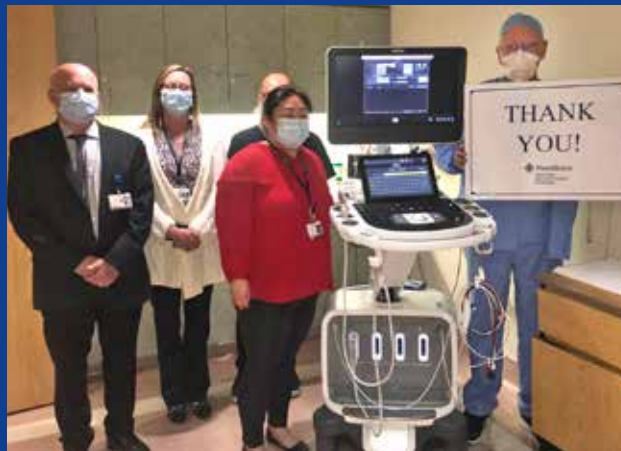
Imaging staff with the new EPIQ Ultrasound