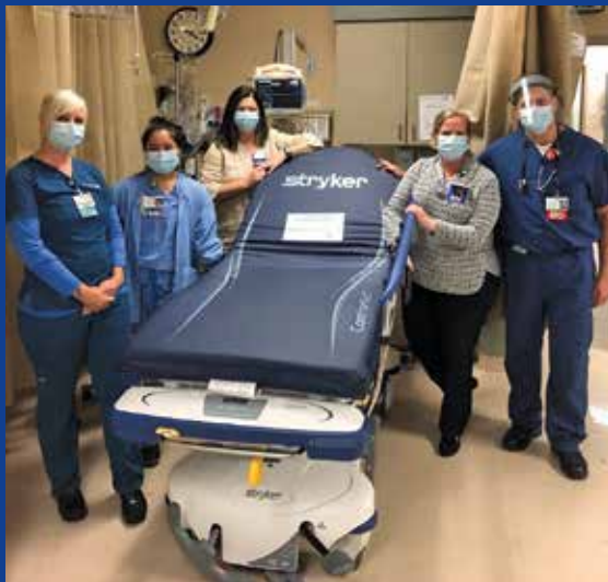
Staff with new gurneys for Emergency Department