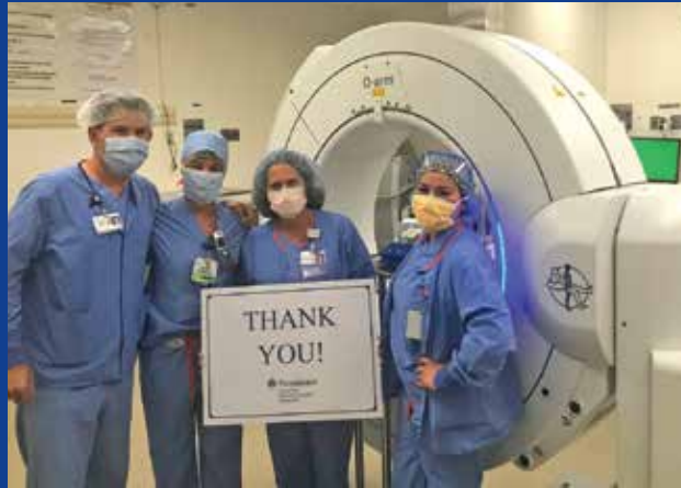
Surgery staff with the new O-Arm