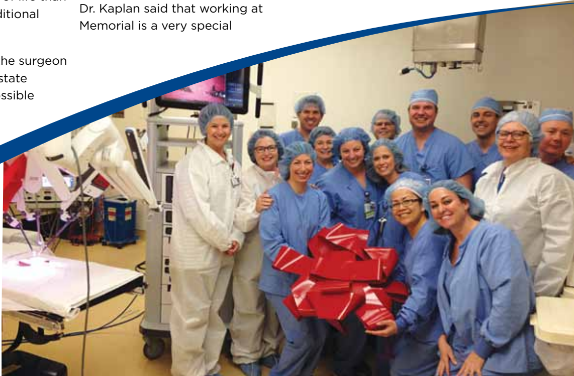
Staff celebrate the arrival of the da Vinci Robot!

As a result of your generosity, our physicians are now able to perform complex life-saving surgeries that otherwise would not be possible.